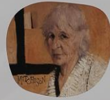
Naomi (Lady) Mitchison, 1897 - 1999. Author Painted by Clifton Pugh